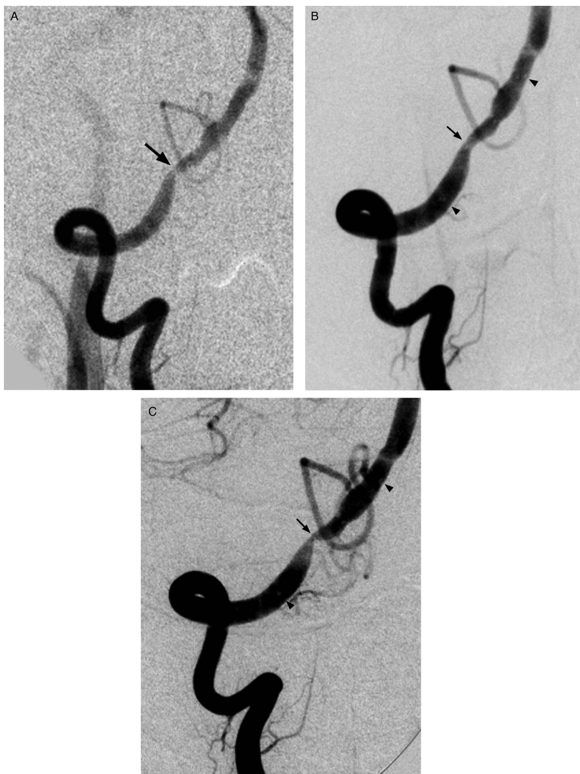
Figure 3 In a man with stenosis at distal V3, digital subtraction angiography showed 66.7% stenosis at prestenting baseline (A), a residual stenosis of 43.6% immediately post-stenting (B), and 86.6% stenosis at 1 year (C). There was a 72.7% luminal loss 1 year after stenting (C). The lesion is shown by an arrow and the ends of the stent are indicated by arrowheads.

and avoiding the use of multiple loading doses of preprocedural clopidogrel may help to reduce the risk of periprocedural intracerebral hemorrhage.