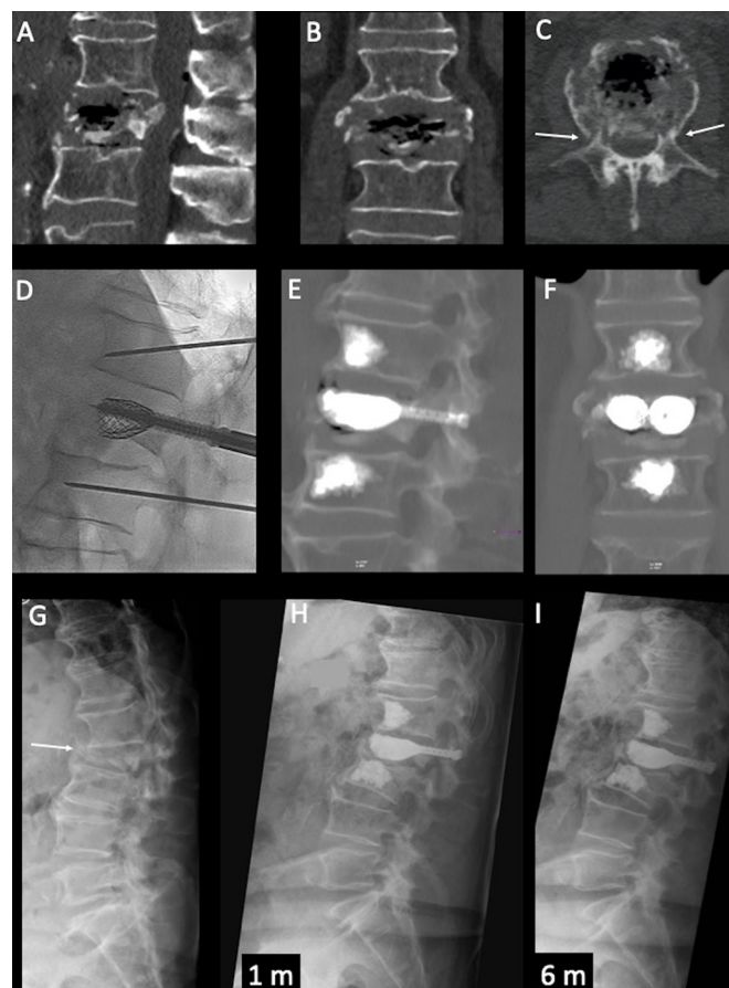
Figure 3 (A-C) An extremely severe fragmentation of an L2 vertebral fracture, with middle column involvement, large air-filled cleft, and bilateral pedicular fracture (arrows on C). (D) A fluoroscopic image of the stent-screw-assisted internal fixation (SAIF) set-up, with stents expanded, screws inserted, and small-caliber cannulae inserted at adjacent levels for prophylactic augmentation; (E and F) Post-SAIF CT scan, showing reconstruction of the vertebral body and the screws' internal fixation. (G) Standing plain film, preprocedure, with severe collapse and focal kyphosis (arrow), which appears markedly reduced at 1-month follow-up (H), with stable results at the 6-month standing film (I).

Most osteoporotic VCFs are stable lesions, with AC injury, and augmentation can reinforce the VB and prevent further collapse. Severe VCFs, however, almost invariably feature MC involvement. In these situations, VA, leaving the MC as a non-augmented bare area (figure 1), might represent undertreatment, while surgical fixation is invasive, carries high rate of fixation